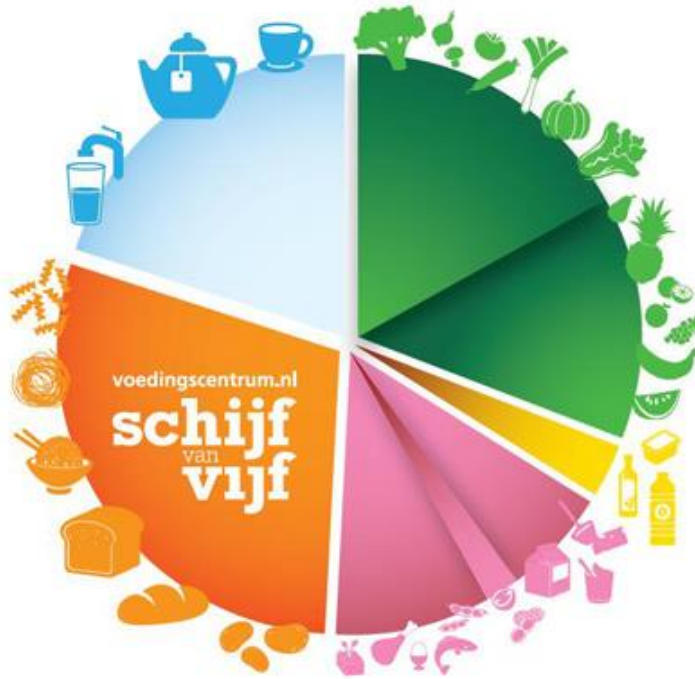
Figure 1. The Schijf van Vijf represents the Dutch equivalent of the Canadian Food Guide.

interview participant did not, however, bring the Schijf van Vijf up on his own terms, only when asked if there was anything similar to the Canadian Food Guide, and was not mentioned till the end of the interview.