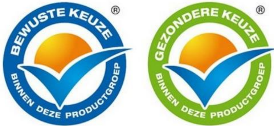
Figure 2. Shows two Dutch front of pack labels. “Bewuste keuze” translates to “conscious choice” and “gezondere keuze” translates to “healthier choice” in English.