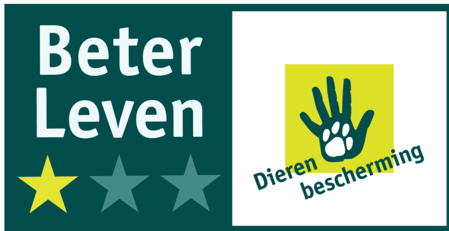
Figure 3. Beter Leven Label. Represents the quality of life an animal had prior to packaging.

The use of universal symbols is also beneficial for the Beter Leven symbol and its effectiveness. No matter what climate you are in, the idea of three stars versus one star is a universal concept and clearly understood. The Netherlands should consider continuing this shift to using universal symbols in labelling. The purpose of the label can be more easily understood regardless of an individual’s language and culture.