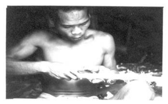
Preparing ornament to bathe pregnant women. See Dentan 1978. East Semai, 1962.