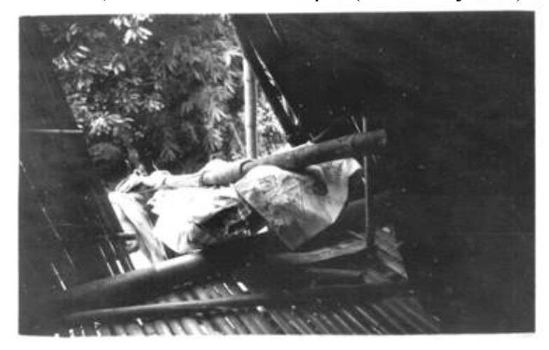
Corpse leaving the house. East Semai, 1962. See "The Semai"