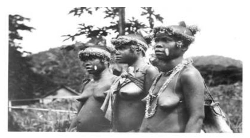
Photograph by Division of Photography Field Museum of Natural History When accepting this Picture for Publication Credit Must Be Given the Institution.