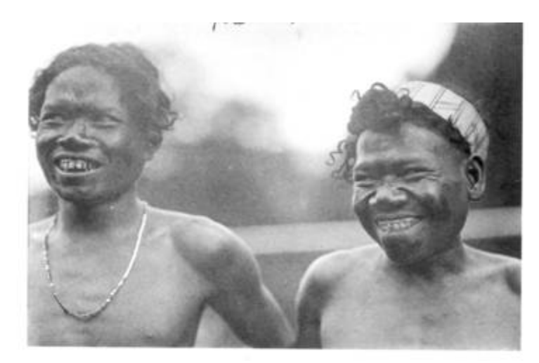
Photograph by Division of Photography Field Museum of Natural History When accepting this Picture for Publication Credit Must Be Given the Institution.