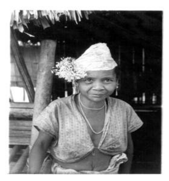
Dressed in barkcloth-and-flower hat and blouse for song-ceremony 1962

Category: Kids rehearse/play adult behavior for "sing" (Adults would never do this dance outdoors or by daylight, for fear of supernatural disaster).