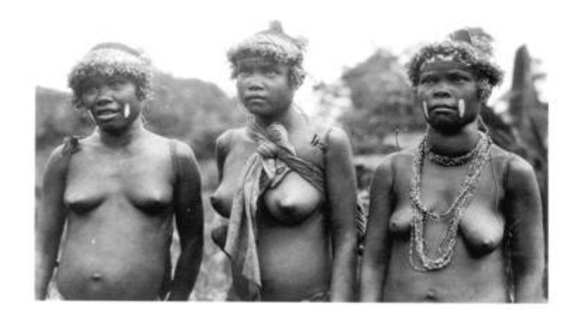
Photograph by Division of Photography Field Museum of Natural History When accepting this Picture for Publication Credit Must Be Given the Institution.