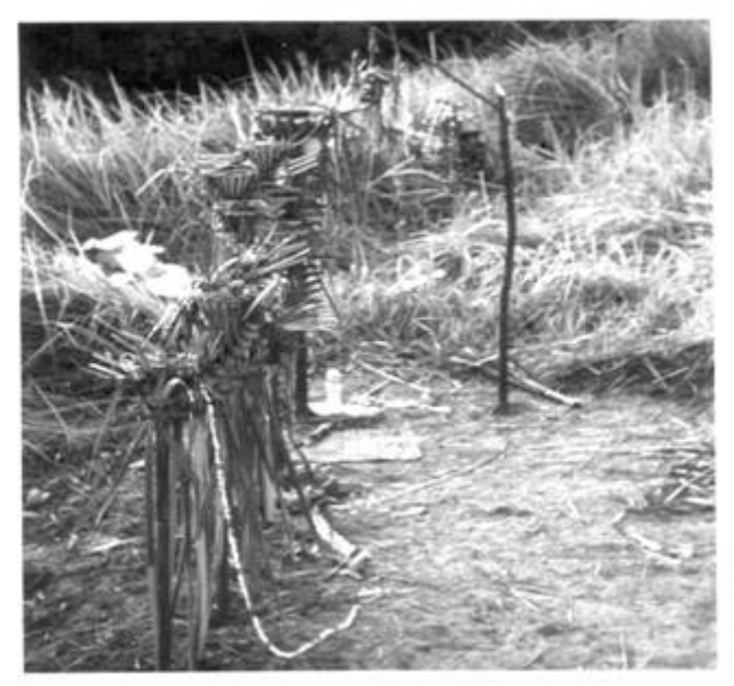
A Semai harvest altar. Teio Manchang, Perak, 1963. Wards off ill year round.