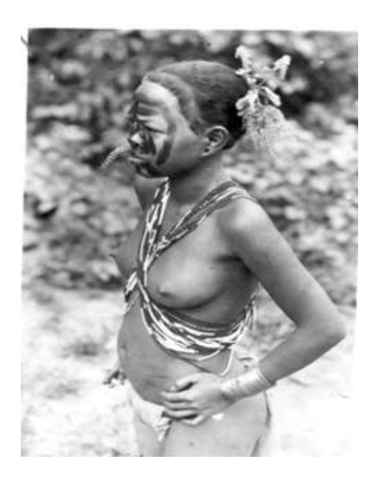
"Men's loincloths are long, women's are short" Semai proverb