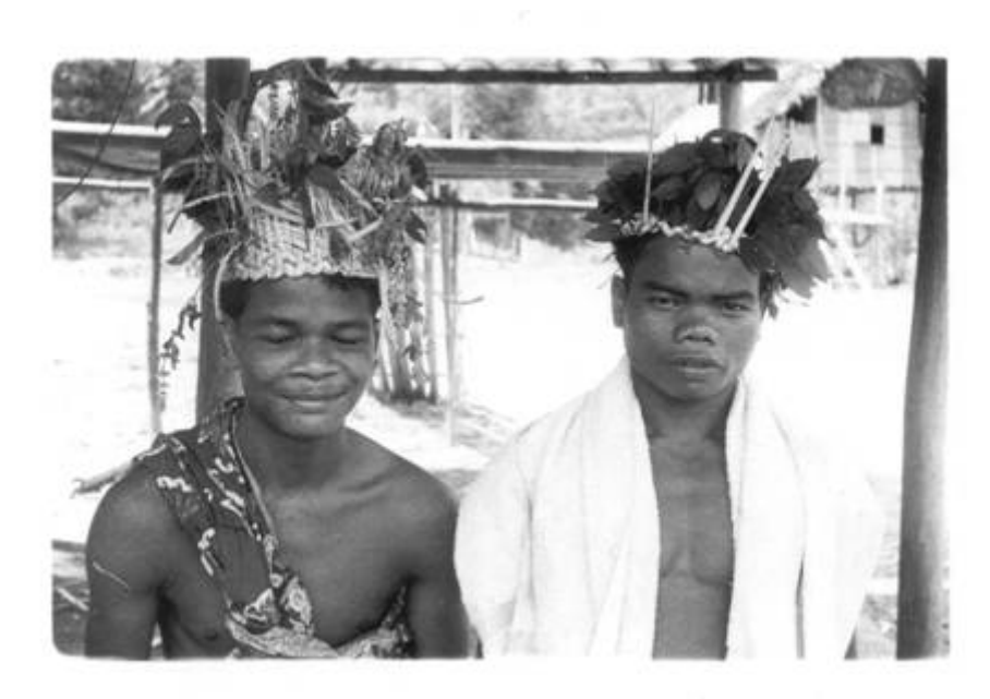
Woven headdress for young Semai and Temiar man preparing to flirt at song-ceremony. Leaves and flowers are scented and attract gunig.