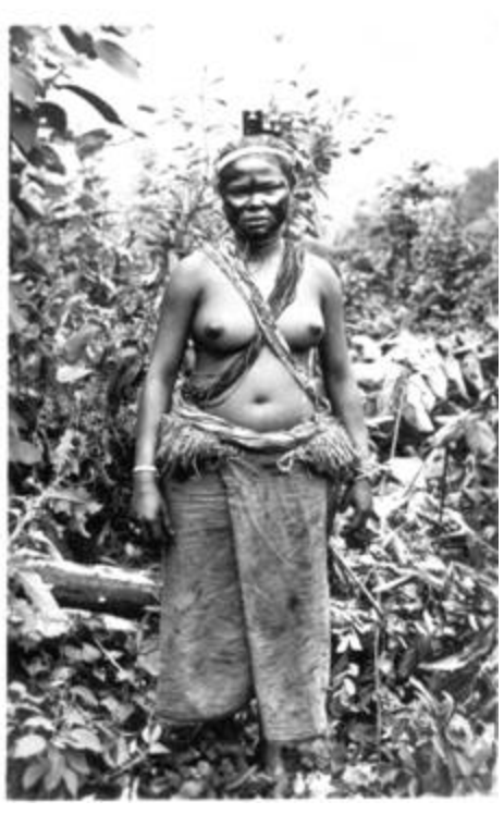
Barkcloth sarong abaad with sacred plants to prevent falls tucked in