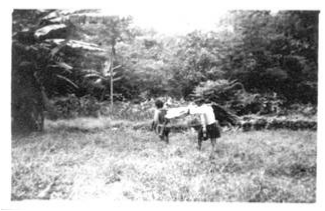
East Semai funeral, 1962 see Dentan 1979 "The Semai," 2<sup>nd</sup> ed.