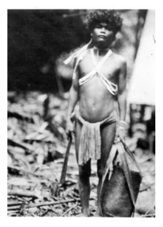
Photograph by Division of Photography Field Museum of Natural History When accepting this Picture for Publication Credit Must Be Given the Institution.