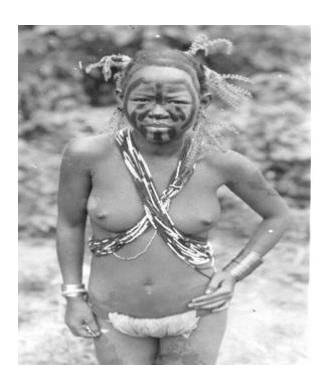
Hairline shows that she's unwed.