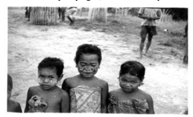
Kids copying dress up for "sing" East Semai 1962.

Category: Kids rehearse/play adult behavior for "sing" (Adults would never do this dance outdoors or by daylight, for fear of supernatural disaster).