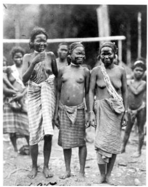
Photograph by Division of Photography Field Museum of Natural History When accepting this Picture for Publication Credit Must Be Given the Institution.