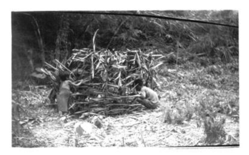
Building a cover so that the rain and dirt won't hurt the corpse – east Semai, 1962. See "The Semai"