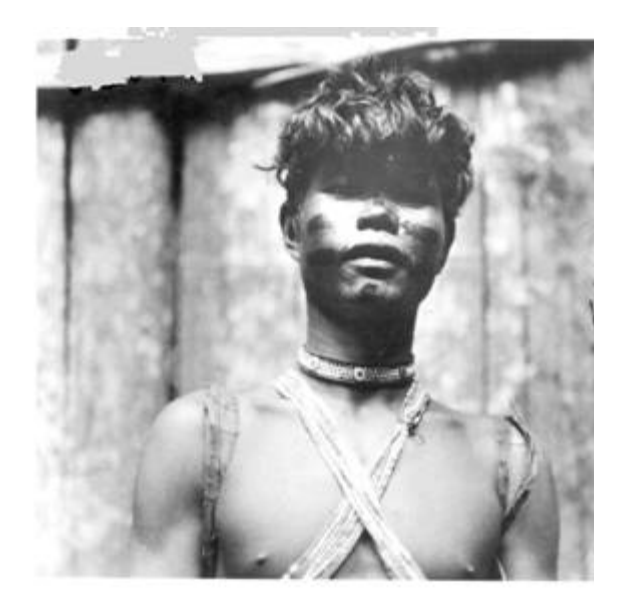
Photograph by Division of Photography Field Museum of Natural History When accepting this Picture for Publication Credit Must Be Given the Institution.