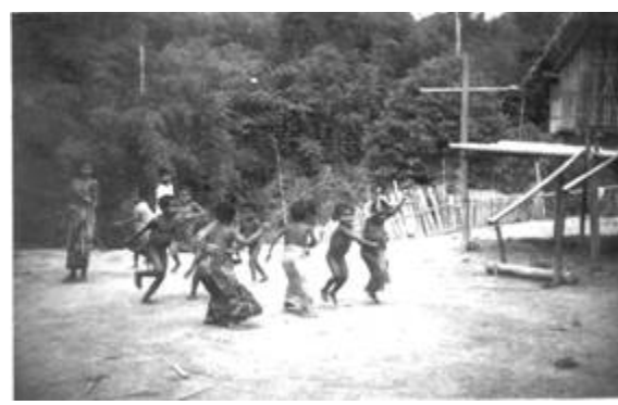
East Semai children rehearsing "circle dance" in which adolescents go into trance as aprt of "sing" (curative-preventative-social-flirting-trancing-singing ceremony). Dentan 1978, 1979, i.p.