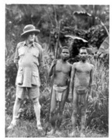
Photograph by Division of Photography Field Museum of Natural History When accepting this Picture for Publication Credit Must Be Given the Institution.