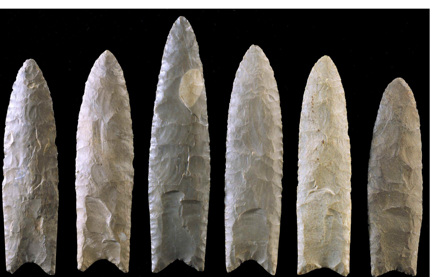
Figure 4. Clovis Points (LCL 2008b)

This position argues that Clovis peoples were the first culture in North America and that they arrived via the Beringia land bridge; it is the most commonly accepted answer to the question of "How did all these pre-European-contact people arrive in the Americas?" Research by Westley and Dix (2008) focuses on the "Last Glacial Maximum", which is a term that describes the height of the last glacial period), and if there had indeed been an ice ridge that assisted the Solutrean peoples in their proposed westward journey. Westley and Dixx (2008) found that there is a problem with the very geological features in which the Solutrean Hypothesis has been formed around, which is that the human migration along this route would have been extremely difficult if not impossible. Westley and Dix (2008) conclude that humans travelling along the ice ridge would have come into contact with many problems, such as the lack of sustainable sea-ice in some areas along the ridge. This would make travelling on the ice difficult, because of having to traverse large, open water channels, which in turn would have drove the Solutreans northwards in search of ice to cross. Westley and Dixx (2008) also note that wind directions at the time would have most likely been blowing east-ward, rather than towards the west, providing a challenge to the possibility of Solutrean peoples travelling across open water via sailing boats or water craft that rely on a rowing technique.