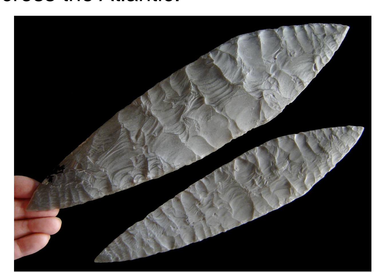
Figure 3. Solutrean Points (LCL 2008a).

It is speculated that the Solutreans of modern day Iberia traveled along the Atlantic ice ridge by walking across ice sheets, and using watercraft made from animal skins that would be similar to the boats that Inuit and other polar peoples used in the past in order to cross the Atlantic.